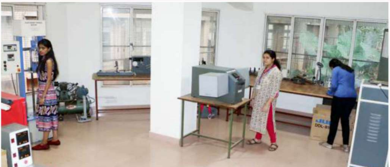
TEXTILE TESTING LAB